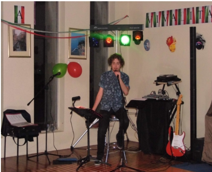
Our Italian visitor showing us his talents.