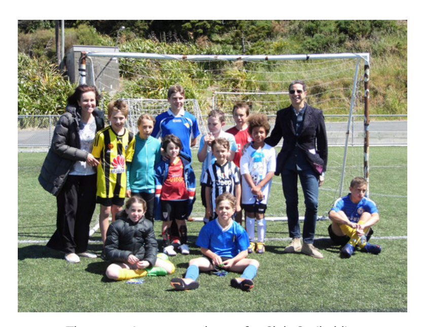
The upcoming soccer players for Club Garibaldi.