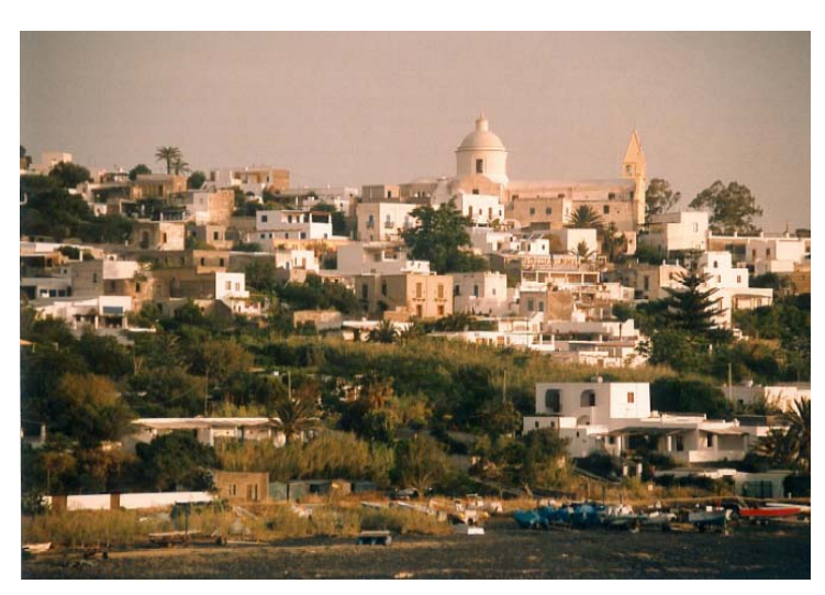
Scari, looking towards San Vincenzo

The Strombolani speak a dialect unique to the Aeolians that varies slightly from island to island. The many cultures to have invaded the islands each left their mark, with many words and phrases introduced by the Greeks, Carthaginians, Spanish, Romans, Arabs, Saracens, Vandals and Turks.