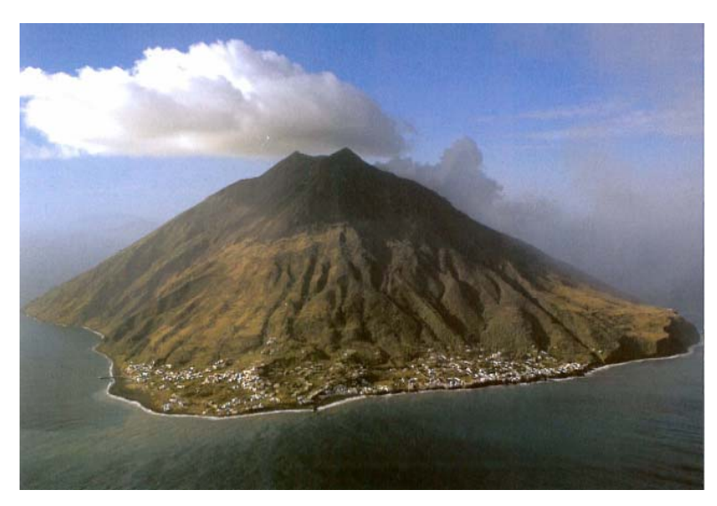
Aerial view of Stromboli

The name 'Stromboli' derives from the ancient Greek word (Stroggyle) because of its round shape. The ancient Roman writer Plinius writes of it as 'Strongyle'. In Italian, the island is called Stromboli, but in dialect (vernacular) the name is still linked to the ancient Greek version – it is known as Struognuli and his inhabitants call themselves Struognulari.