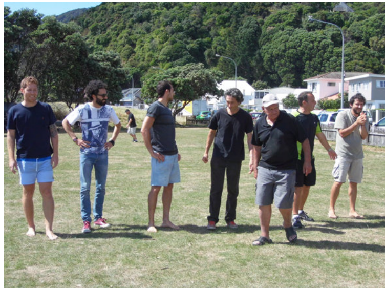
Men getting ready for the Race.