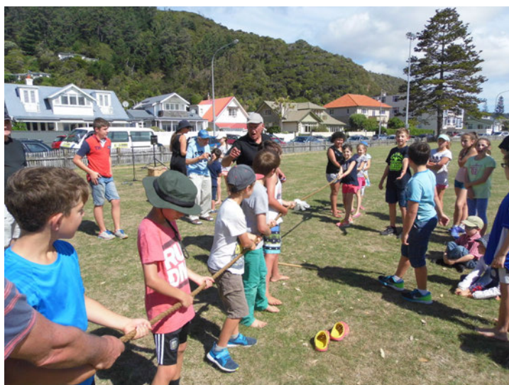
Tug of War.