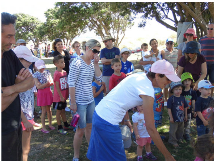
Junior Garibaldini kids lining up for the pinata bashing.