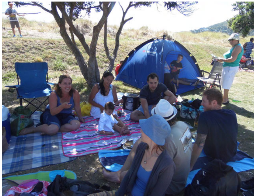
Relaxing and Eating.