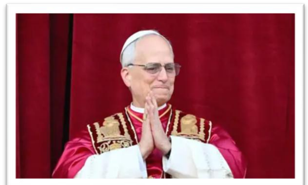
Pope Leo XIV