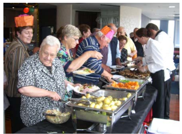
Members at the buffet table