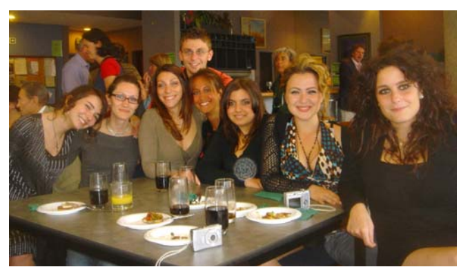
A group of our visitors

Another wonderfully successful function at Club Garibaldi!