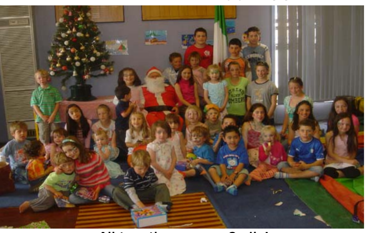
All together now ... Smile!