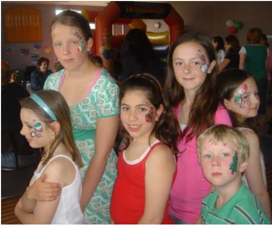
5 pretty girls and one handsome lad