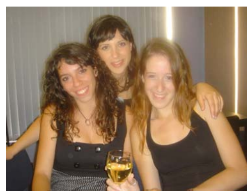
Three beauties smile for the camera