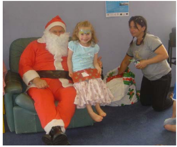
Santa with another pretty young girl