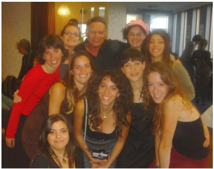
Robin's comment: Well someone had to do it!