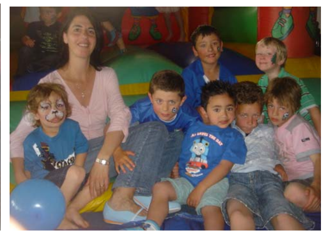
Having a wee rest!