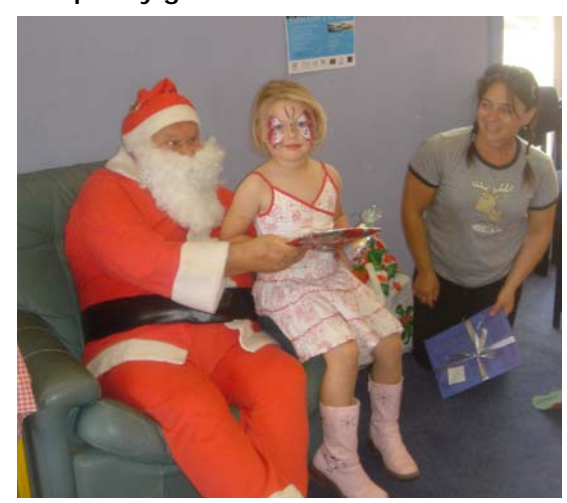
Santa with a pretty young girl