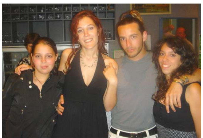
There were some guys as well!