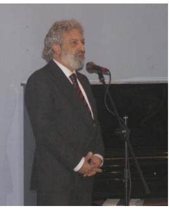
giving his speech