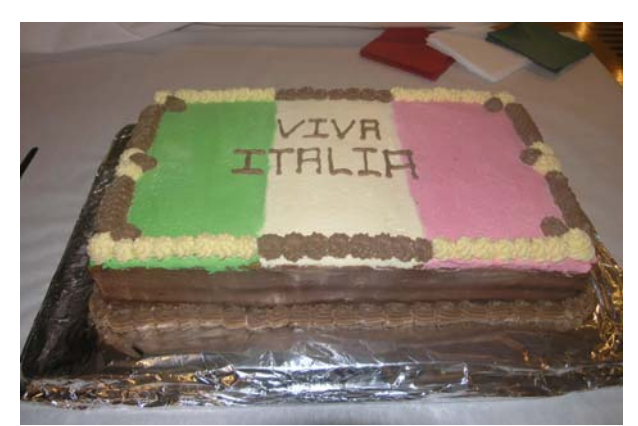
The celebration torta