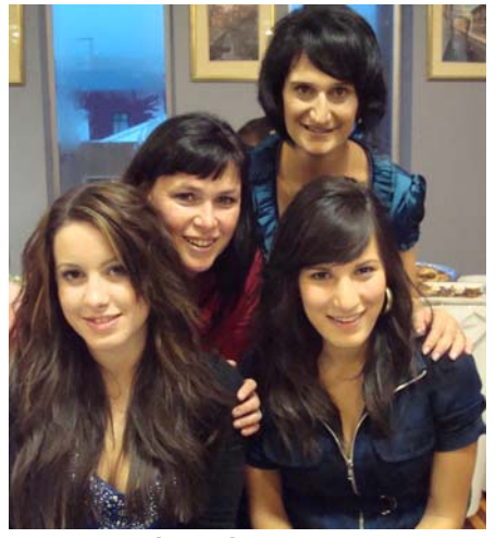
Lovely Nelson guests