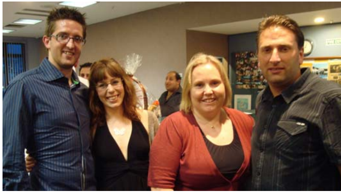
More smiles for the camera!