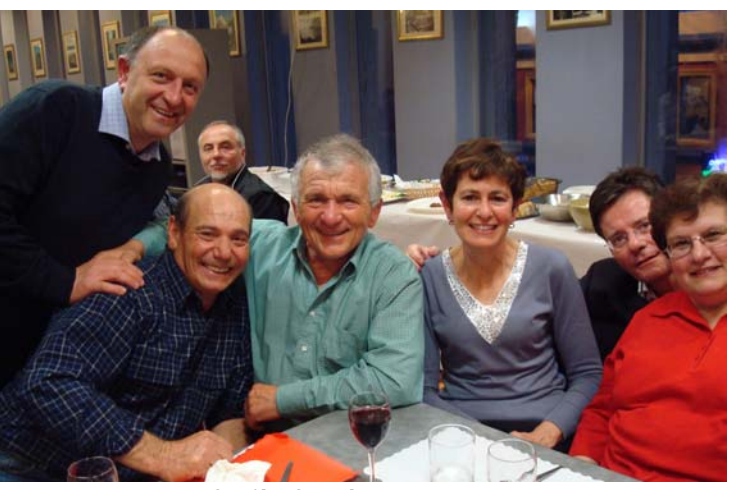
Smile for the camera!