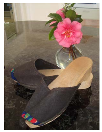
Original hand-made Italian zoccoli

In the 15th century the first zoccoli appeared in Italy. At that time zoccoli had a 20cm heel in the rear and a kind of high plateau in the front. Probably the first zoccoli might have been also the first high heels! It was very difficult to walk in those zoccoli, but of course they were pretty stylish and so zoccoli became popular in the trend-setting city centres of style, arts and culture like Venice.